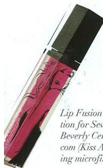
Lip Fusion Luxe Boudoir Capsule Collection for Seven Bar in Lolita, $29, Sephora, Beverly Center, LA, 310-657-9670; sephora.com (Kiss Away Poverty campaign benefiting microfinance institutions)