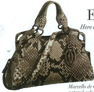
Marcello de Cartier natural-colored python skin bag, price upon request, Cartier, Beverly Hills, 310-275-4272