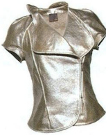
Fendi gold cropped sleeveless jacket, $3680, Neiman Marcus, Beverly Hills, 310-550-5900