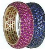
Asprey micro pavé ring in pink sapphire and blue sapphire, $2750 each, Asprey, Beverly Hills Hotel, 310-550-0520, asprey.com