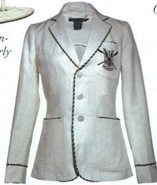
Ralph Lauren Blue Label jacket, $398, Saks Fifth Avenue, Beverly Hills, 310-275-4211