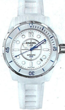
CHANEL J12 Marine watch, $4700, CHANEL Fine Jewelry Store, Beverly Hills, 310-278-5500