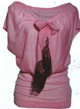
Nina Ricci top, $1690, Neiman Marcus, Beverly Hills, 310-550-5900