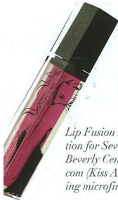
Lip Fusion Luxe Boudoir Capsule Collection for Seven Bar in Lolita, $29, Sephora, Beverly Center, LA, 310-657-9670; sephora.com (Kiss Away Poverty campaign benefiting microfinance institutions)